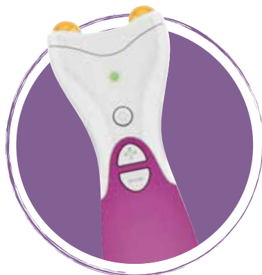
RIO CHIN AND NECK TONER £29, LOOKAGAIN.CO.UK

Give your new workout an energising boost with these toning gadgets. They can help stimulate and tone your facial muscles at a deeper level, a bit like using resistance machines at the gym.