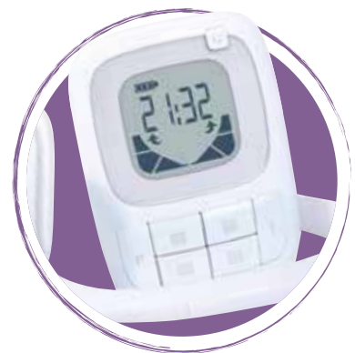
SLENDERTONE FACE TONER (£149.99, SLENDERTONE.COM )

An electrical current stimulates each muscle, making it contract as if it were being exercised, helping to tone and lift your skin, as well as smooth out lines and wrinkles. It's pain free and you only need to use it for five minutes per day.