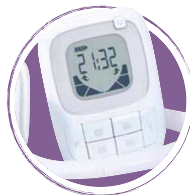
SLENDERTONE FACE TONER (£149.99, SLENDERTONE.COM )

An electrical current stimulates each muscle, making it contract as if it were being exercised, helping to tone and lift your skin, as well as smooth out lines and wrinkles. It's pain free and you only need to use it for five minutes per day.